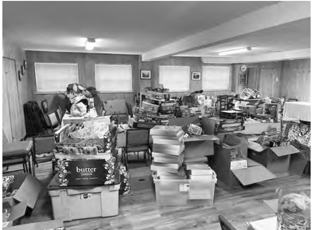
Just a small sample of the TONS of donations collected by OASIS Shriners and Masons of North Carolina.