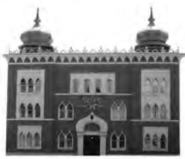
Kora Shriners A.A.O.N.M.S.