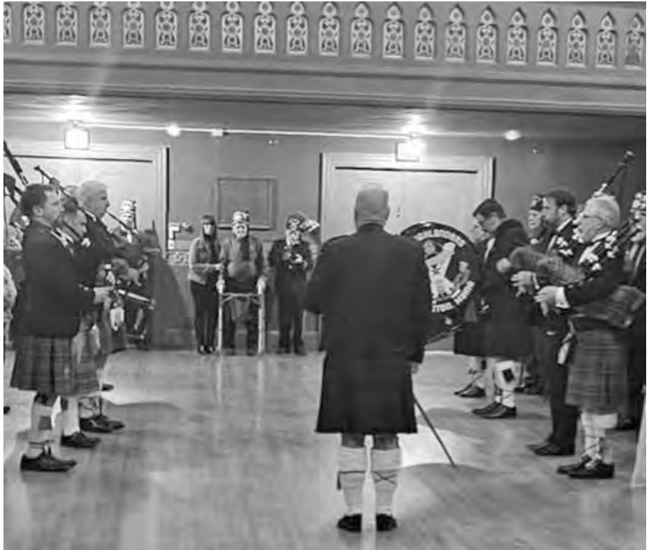
The Highlanders play a final tribute to those Nobles who passed away in 2024 at the Necrology Ceremony on Jan 11th.

Until next time, Slainte mhath (good health) and Sealbh m ath dhuit (good luck)