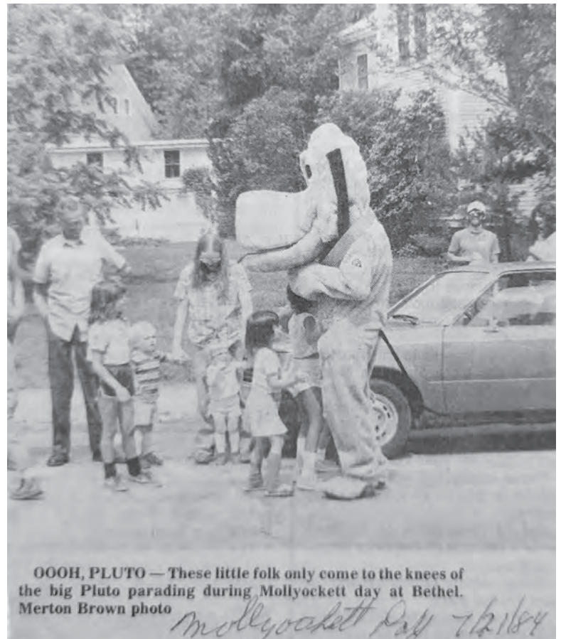
OOOH, PLUTO — These little folk only come to the knees of the big Pluto parading during Mollycokett day at Bethel.