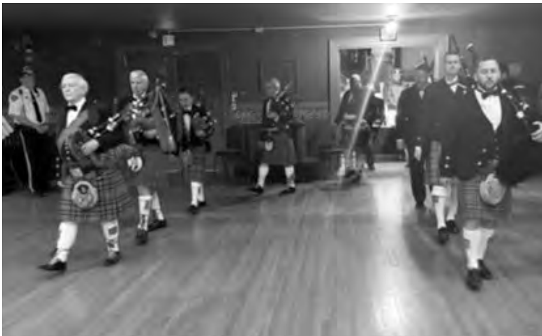
The Highlanders enter the Hall for the Necrology

Until next time, Slainte mhath (good health) and Sealbh m ath dhuit (good luck)