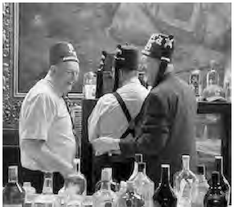
Serving the best drinks in L/A and beyond