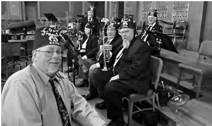
Kora Band getting ready to play at the 2024 Kora Installation of Officers.