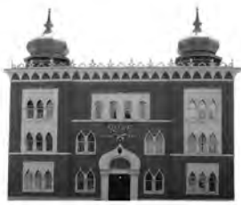
Kora Shriners A.A.O.N.M.S.