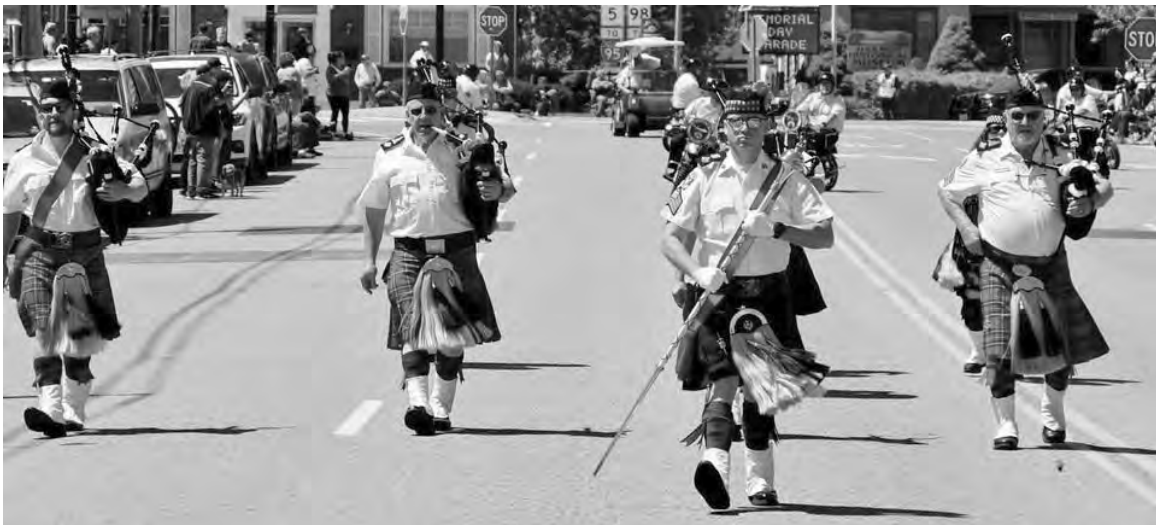
"And they are off" Highlanders at the Memorial Day Old Orchard Beach Parade

Until next time, Slainte mhath (good health) and Sealbh m ath dhuit (good luck)