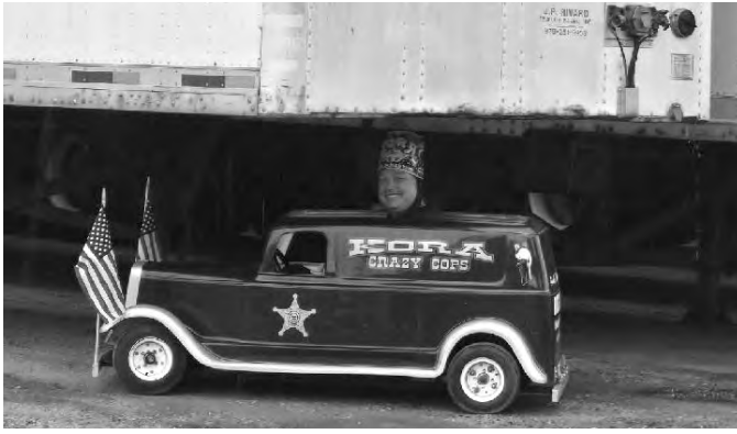
Our past potentate doesn't like to get wet.